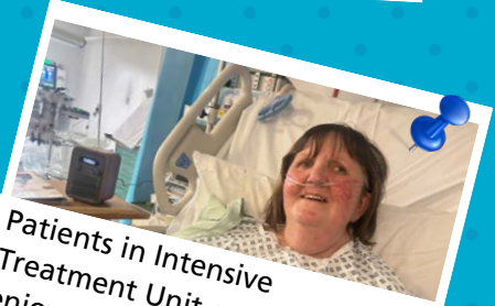
Patients in Intensive Treatment Unit can now enjoy the comfort of music.