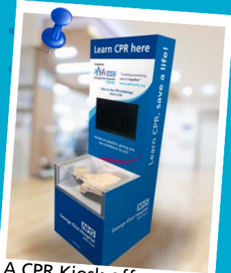
A CPR Kiosk offers community training - how to perform chest compressions.