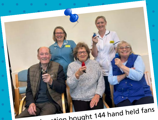
A £100 donation bought 144 hand held fans for respiratory patients.

There are many ways your support helps us make a difference to patients, staff and the wider community.