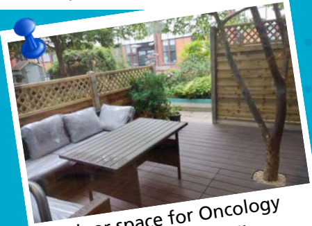
Outdoor space for Oncology patients and their families.